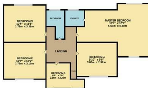
FIVE BED DETACHED

TOTAL FLOOR AREA: 2728 sq.ft. (253.5 sq.m.) approx.